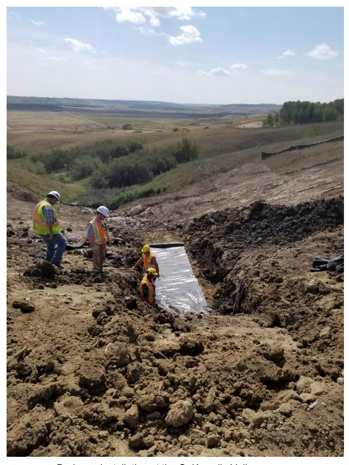
Drainage installation at the Qu'Appelle Valley.