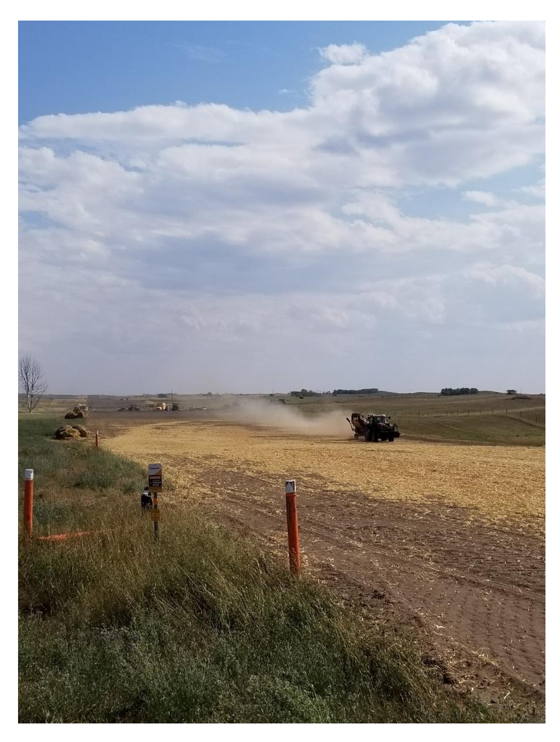
Tractor spreading straw with a processing attachment.