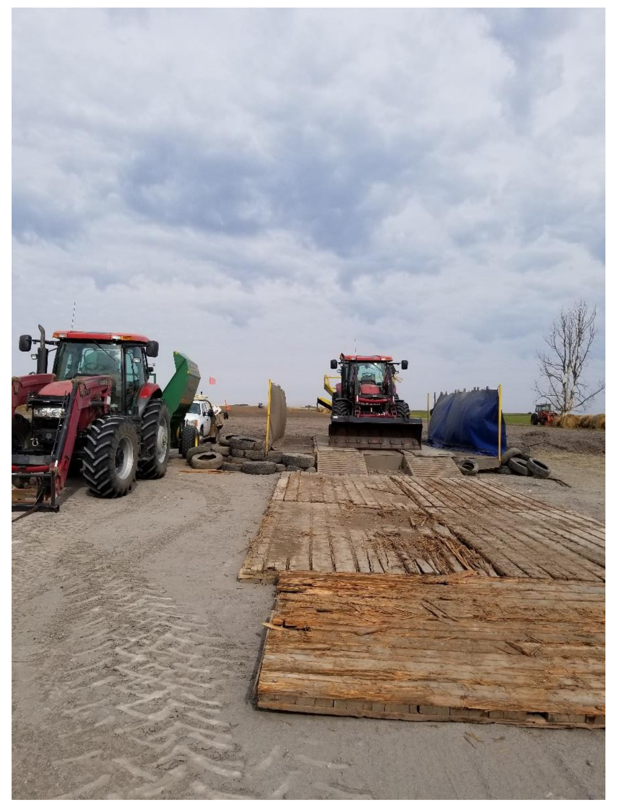
Straw crimping crew going through a Fine cleaning station to proceed to High Pound Hill.